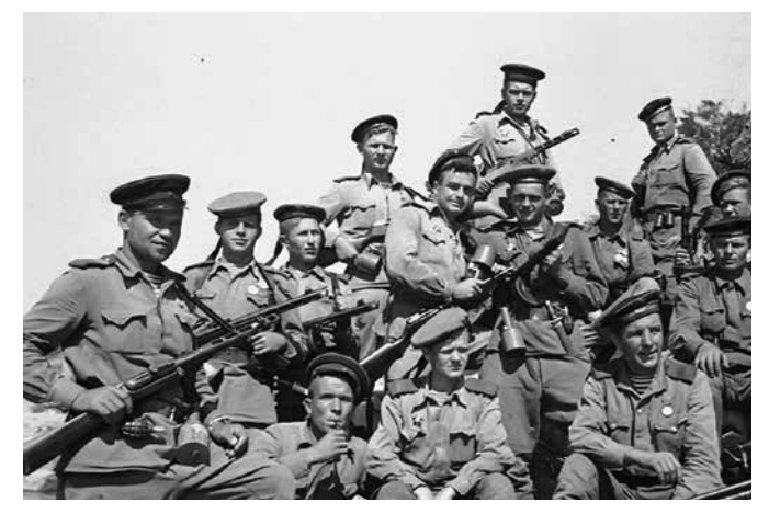
Soviet Naval Infantry

"All of the proposed reductions were meant to serve several purposes: to shift funds to the production of missiles and long-range bombers; to lessen the burden of military force requirements on heavy industry; to free labor for productive purposes in the civilian economy; and to bring international pressure on the United States to reduce its forces."