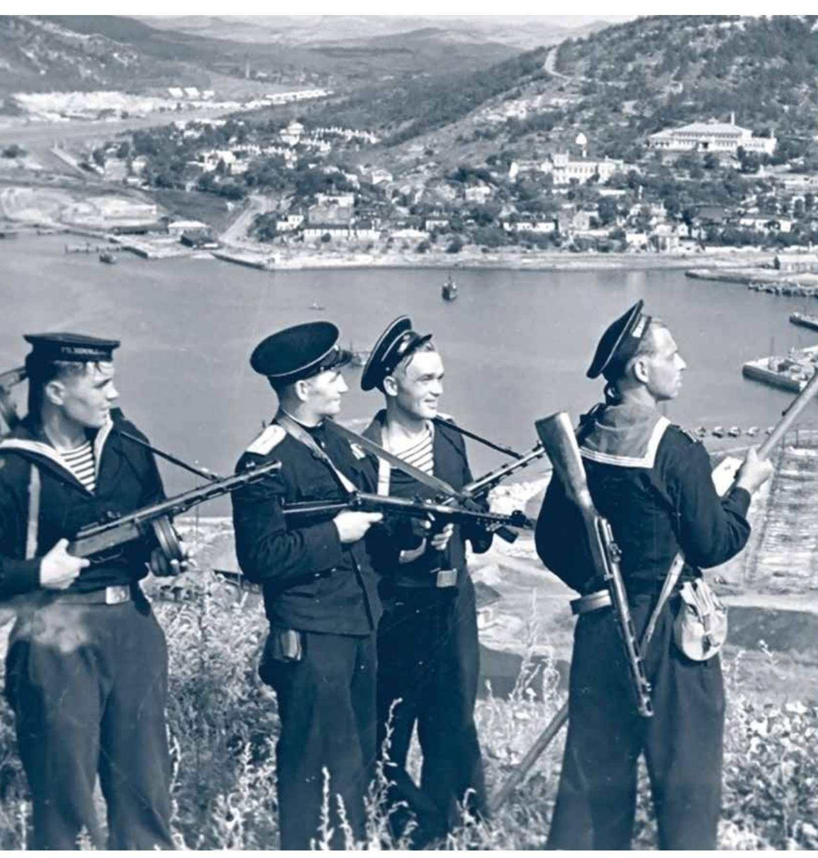
Pacific Fleet Marines of the Soviet Navy hoisting the Soviet Naval ensign in Port Arthur, 1 October 1945