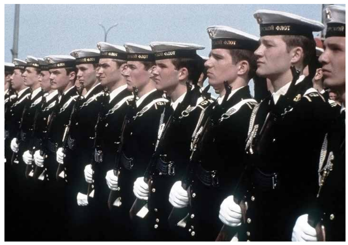
Soviet Navy Personnel—1982

range of Soviet targets. Gorshkov's vision of the Soviet Navy was still years in the future but signs were already appearing in the USSR naval-shipbuilding industry. The Soviets continued to produce long-range missile-carrying bombers and anti-submarine warfare aircraft, nuclear submarines, and had a broad array of major surface combatants under construction, including the Kiev-class aircraft carriers.