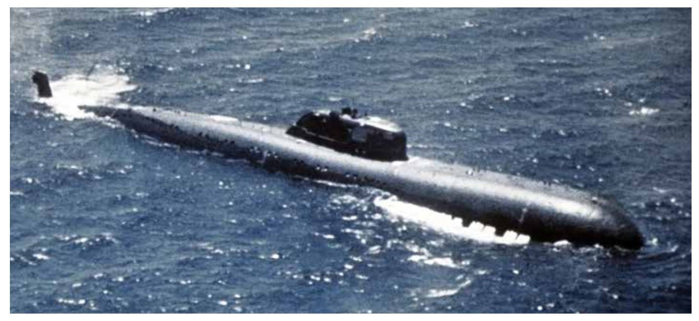
An aerial starboard beam view of a Soviet Charlie I class nuclear-powered submarine underway

War only reinforced Stalin's conviction that the USSR needed a large ocean-going navy. The Soviet leader pushed forward a large construction program that began producing cruisers and fast destroyers at about the time of his death in 1953.<sup>3</sup>