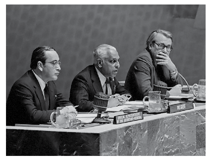
United Nations Convention on the Law of the Sea, 1980

"The 1980 Soviet Law of the Sea treaty negotiating instructions show the Soviets had changed their attitude about naval use of world oceans in two decades from one seeking to restrict Western naval access to one of virtually unconstrained transit of naval ships and aircraft."