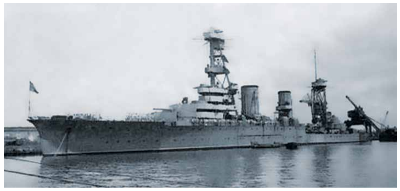
Soviet battleships-fighting U-boats in the Baltic Sea, WWII

The CIA intelligence reports, produced by the Directorate of Operations (DO)<sup>3</sup> made a significant contribution to understanding the history, plans and intentions of the Soviet Navy. Many of these documents are being released for the first time. These intelligence reports, however, do not represent the complete record—much information essential in the estimative process was from émigrés and defectors, as well as from the U.S. Navy, and imagery and signals intelligence, which are not specifically highlighted in this collection.