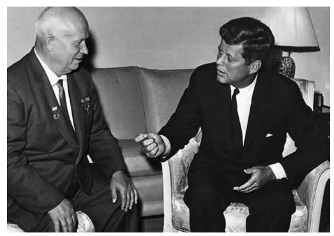
Nikita Khrushchev and John F. Kennedy

"In May 1956, the Soviet military publication, Krasnaya Zvezda (Red Star) , contained the following statement: 'Submarines, having atomic propulsion and guided missiles as basic armaments, can perform at great distances from their bases and secretly strike blows not only against ships but also against land targets deep in enemy territory'."