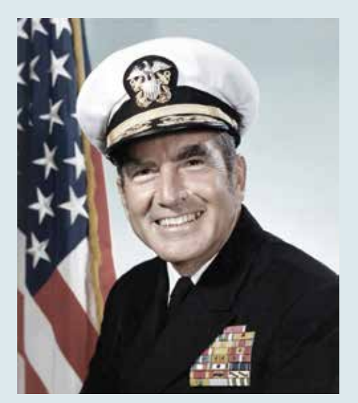
Admiral Elmo Zumwalt