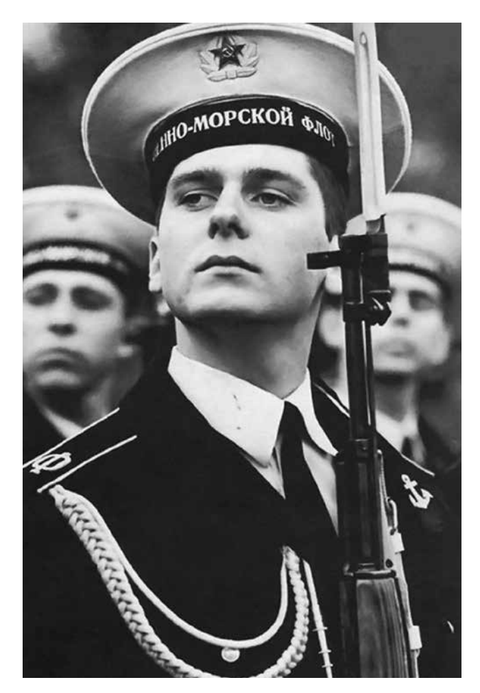
Honor Guard of Soviet Navy

"...Soviet naval deployments would eventually cover all areas of the globe—including the Caribbean. The Cold War at sea entered a new era."